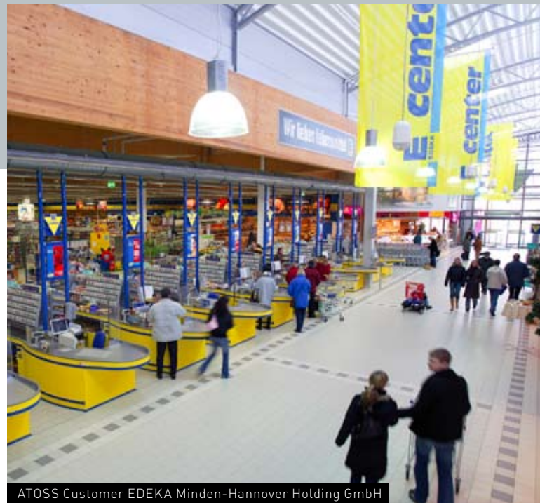
ATOSS Customer EDEKA Minden-Hannover Holding GmbH