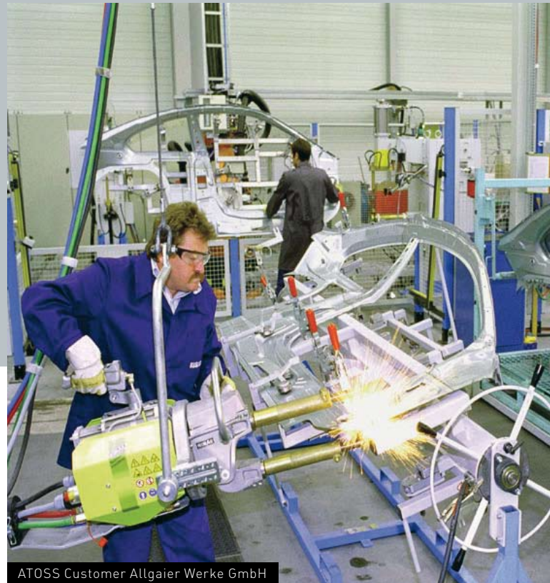
ATOSS Customer Allgaier Werke GmbH

On March 23, 2007, analysts at SES Research stood by the anticipated target share price and raised their rating to "buy". With the company's annual meeting pending and a dividend of € 0.24 proposed, the share price staged a recovery prior to the AGM.