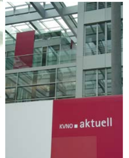
Kassenärztliche Vereinigung (Association of Compulsory Health Insurance Physicians) Nordrhein: Customer since 1999; migrated to the new ATOSS Staff Efficiency Suite 3 in 2005