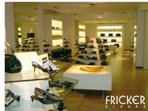
Fricker Schuhe, Switzerland: ATOSS Customer since 2002