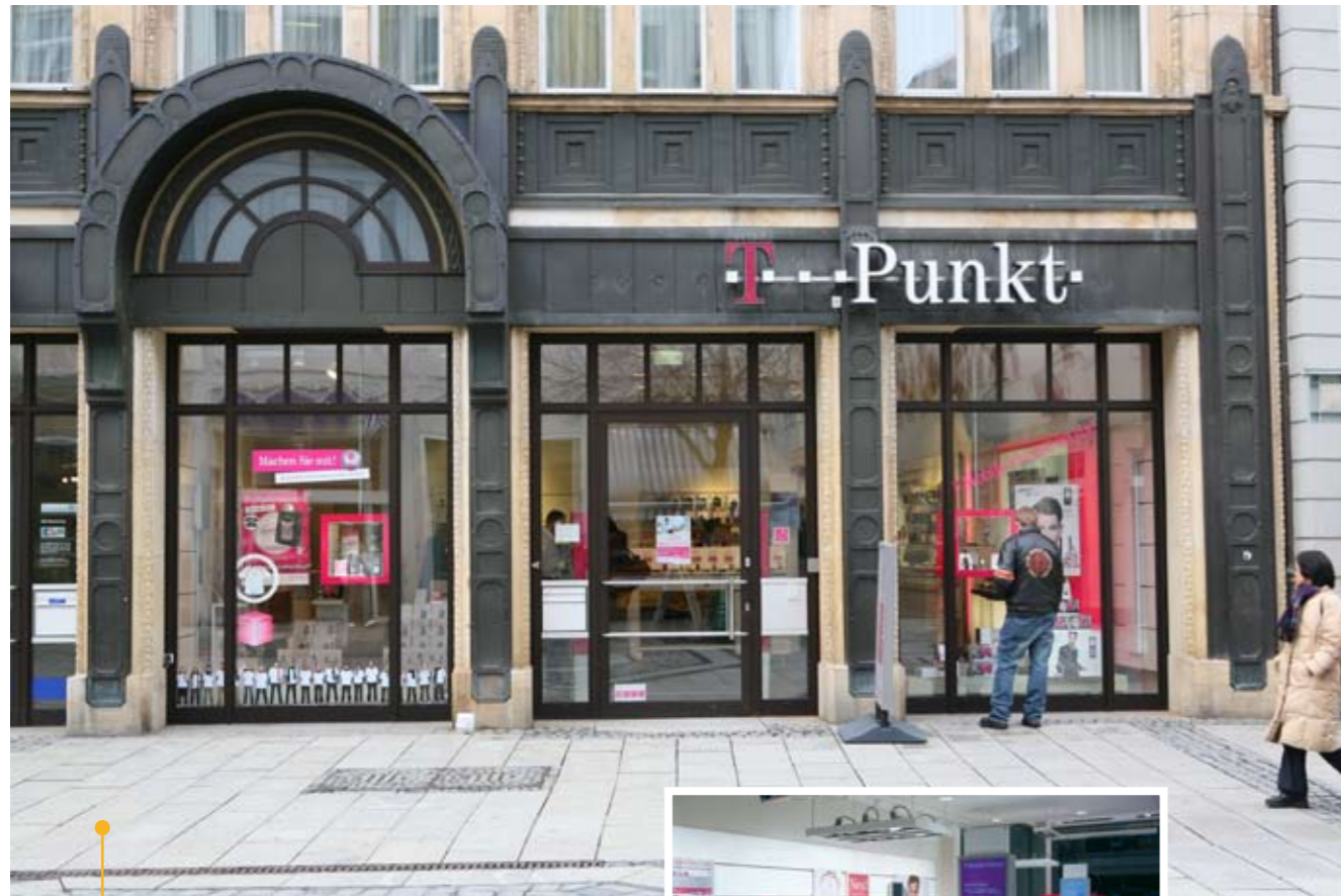
T-Punkt Vertriebsgesellschaft (Distribution Company): ATOSS Customer since 2004