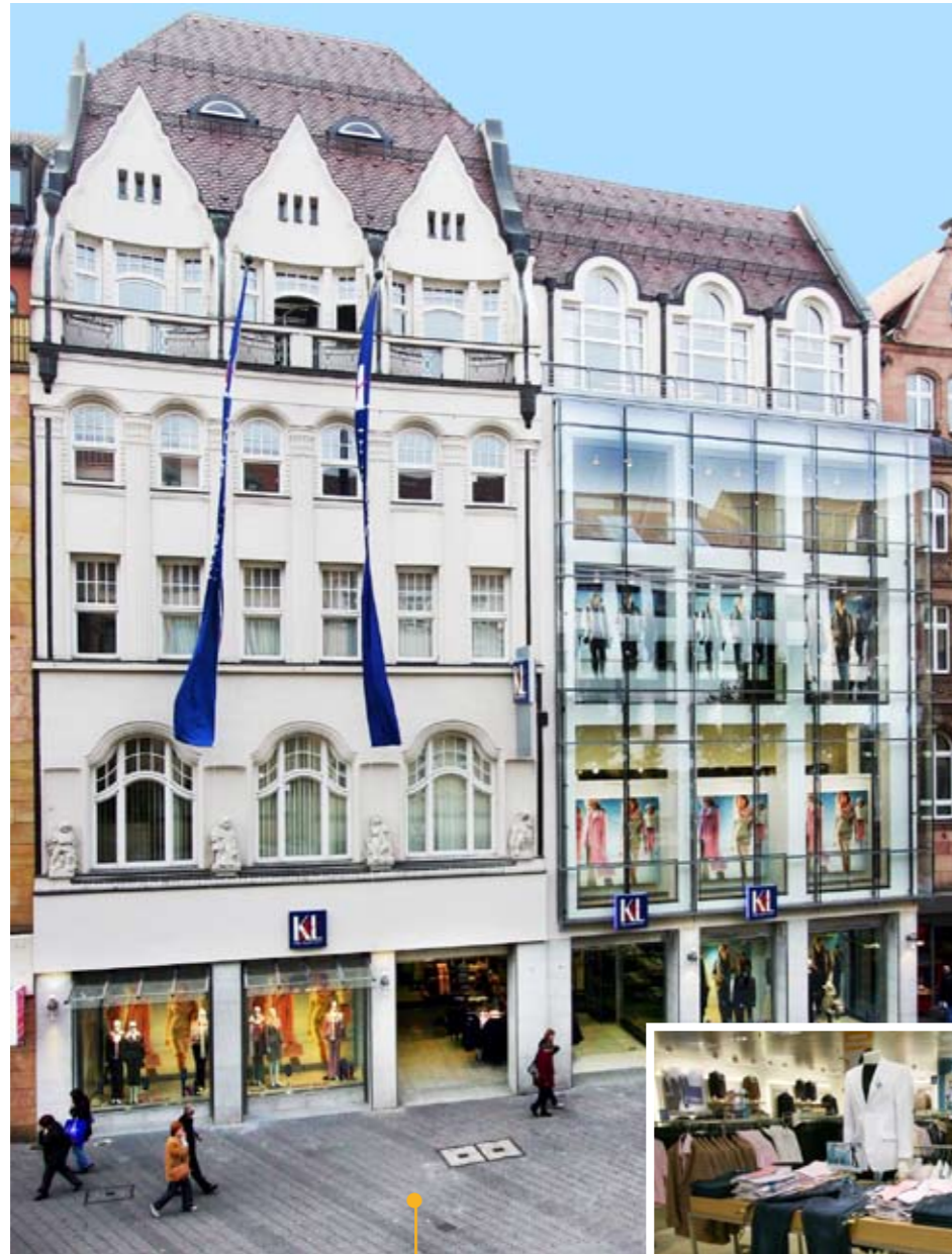
K&L Ruppert: ATOSS Customer since 2006