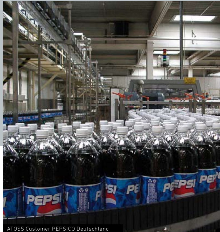
ATOSS Customer PEPSICO Deutschland

Despite a further "buy" recommendation on April 17 and the presentation of the full quarterly figures on April 24, the share price could not be maintained in the second quarter.